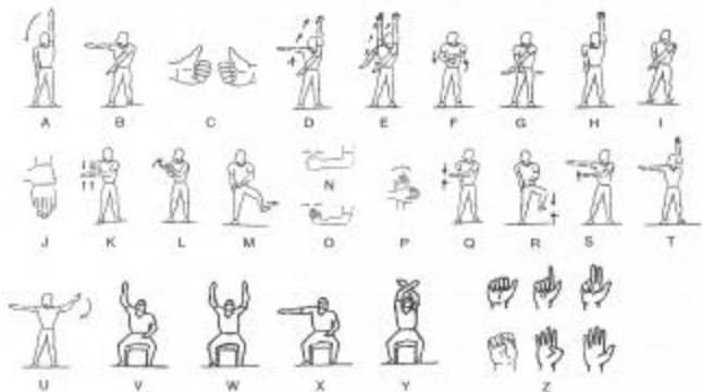
Fig. A The referee lowers his arm from a vertical position to signal (i) the start of the period (ii) to restart after a goal (iii) the taking of a penalty throw.

Fig. B To point with one arm in the direction of the attack and to use the other arm to indicate the place where the ball is to be put into play at a free throw, goal throw or corner throw.